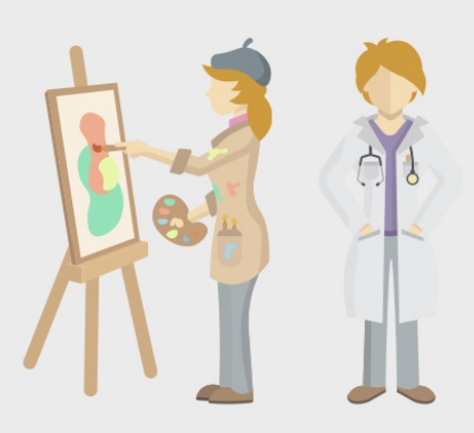
A title is important.